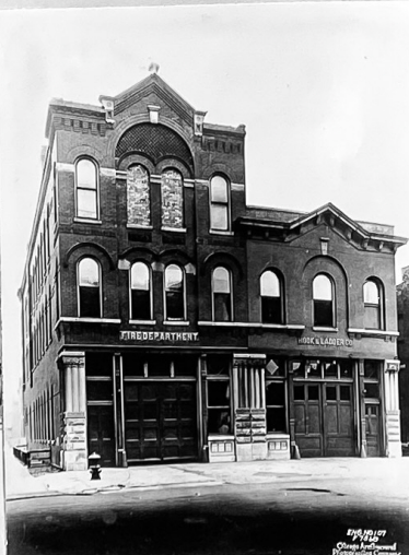
ENG 107 - TRK 12 2258 W. 13 TH St Two separate buildings but considered one house, the Truck originally housed in three story, and later when 107 came they occupied a newer building to the east of the three story.