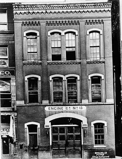
ENG 13 (TOP) 209 N. Dearborn Organized here in the early 1880's and still in operation. ENG 21 (UPPER LEFT) 14 W. Taylor St This was location of first Negro company in Chicago. ENG 104 (Lower Left) 1409 S. Michigan Note carefully the drop harness just inside door up near ceiling, and cross chains along open doors to keep horses from running out in the street before being hitched on an alarm of fire.