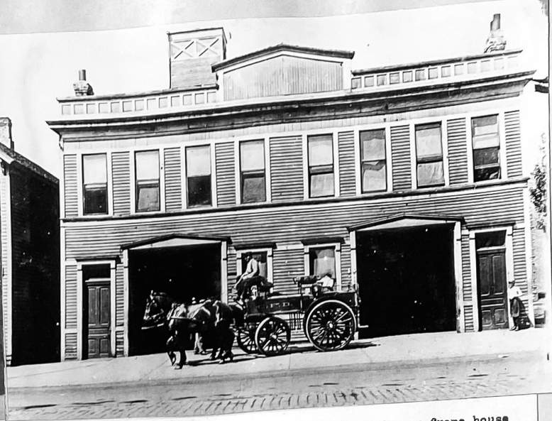
ENG 45's wagon straddles driveway in front of former frame house which stood on present site of quarters at 4602 Cottage Grove about 1915. ENG 45 and TRK 15 moved into their present house on February 29, 1928.