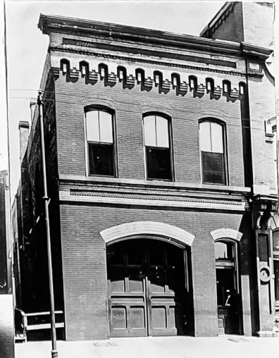
ENG 23 1702 W. 21 ST PL A company of which, since organization has seen some of cities worst disasters in their First-due district. HP 4 was quartered here for some years.