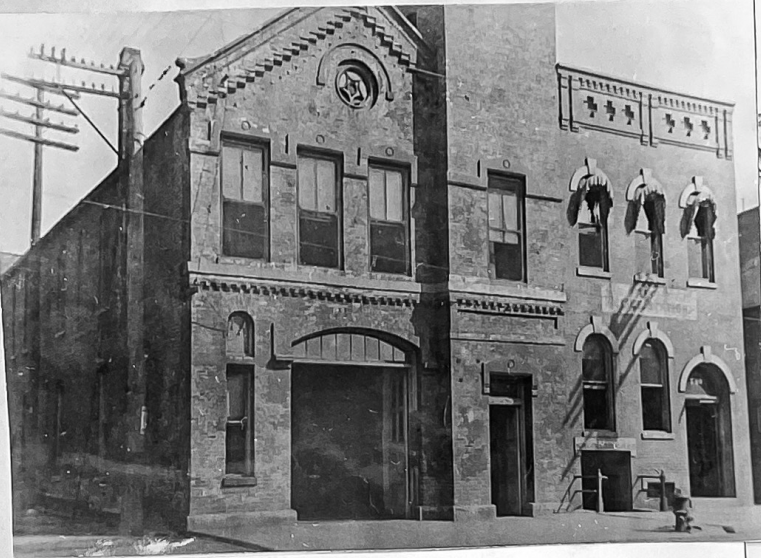
Former house of ENGINE 29 and the Deering police district station located at 744 W. 35 TH Street in the section of Deering, that was razed in 1920. ENG 29 remained here in an old horse barn on the back lot until new house was finished at 3509 S. Lowe Avenue, and occupied it on May 19, 1925.