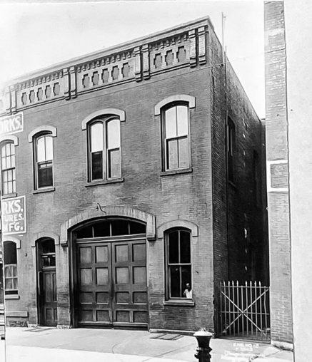
ENG 12 1641 W. Lake St Located here next to former police station, the company awaits the okey to move, and the house wwaits the wreckers hammer.