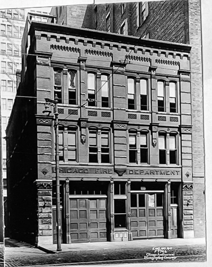
ENG 40 - TRK 6 117 N. Franklin St Still in operation in the Loop even though IBT next door has offered to build them a firehouse with the first three floors of a building they want to build on that site. Squad 1 is now also quartered here.