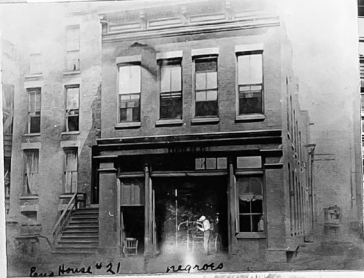
Bar House # 21 negroes