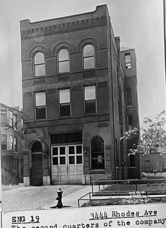
ENG 19 3444 Rhodes Ave The second quarters of the company being organized firstly in frame building at 3425 Cottage Grove, this building occupied until Dec 7, 1953, and to ENG 48, until Apr 16, 1956 to new house at 3421 Calumet Avenue with TRK 11 and AMB 4.