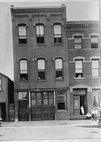
ENG 3 855 W. Erie St Formerly the house of Chemical 3 in the early years this house was headquarters of ENG 3 from Feb 3, 1891 until disbandment May 16, 1956