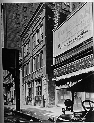
ENG 1 333 S. Wells St Occupied this building until it condemned for erection of the Insurance Exchange, and moved to ENG 21 at 14 W. Taylor St on May 27, 1927. Circa 1920