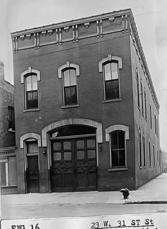
ENG 16 23 W. 31 ST St Put in service here in the 1860's this old structure was occupied by company until Oct 24, 1960 and company moved to ENG 48, Batt 10 to new house of ENG 19 and TRK 11.