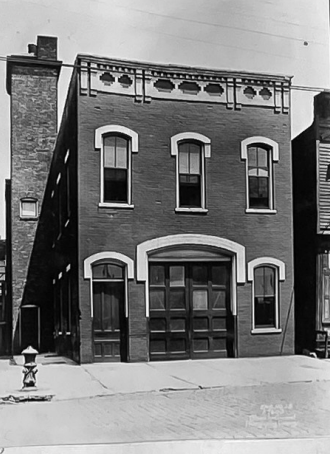
ENG 15 1156 W. 22 ND St Organized here in this building ENG 15 remained until disbandment on Feb 2, 1932 to be re-organized at 8028 S. Kedzie Ave in Scotsdale on Apr 4, 1957 with Truck 59.