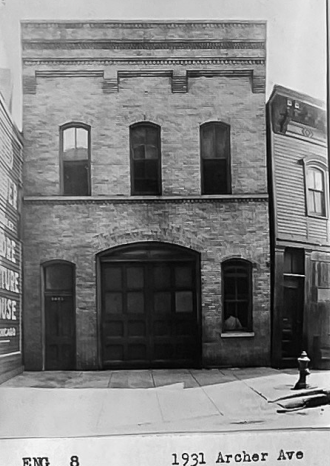
ENG 8 1931 Archer Ave Taken over by Forestry Division in 1936 when company moved to TRK 4 in Chinatown, 214 W. 22 ND.