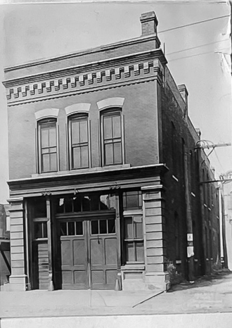
ENG 4 1244 N. Halsted St Original house of Truck 10 until 1884 when ENG 4 occupied same until Feb 2, 1960.