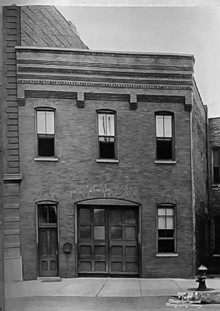
ENG 9 2527 Cottage Gr Building razed after unit moved to 2341 S. Wabash on Nov 27, 1926.