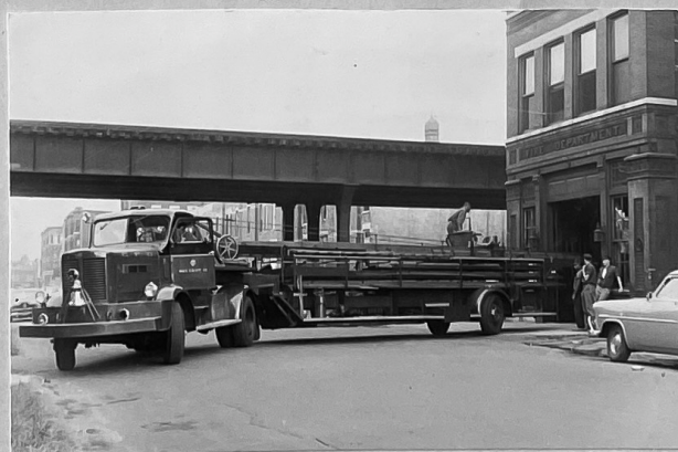
This historic picture shows Truck 11 backing into their old house at 9 E. 36th Place for one of the last times before they moved to Calumet Avenue in 1956. House dates back to the last century A.D. 1885.