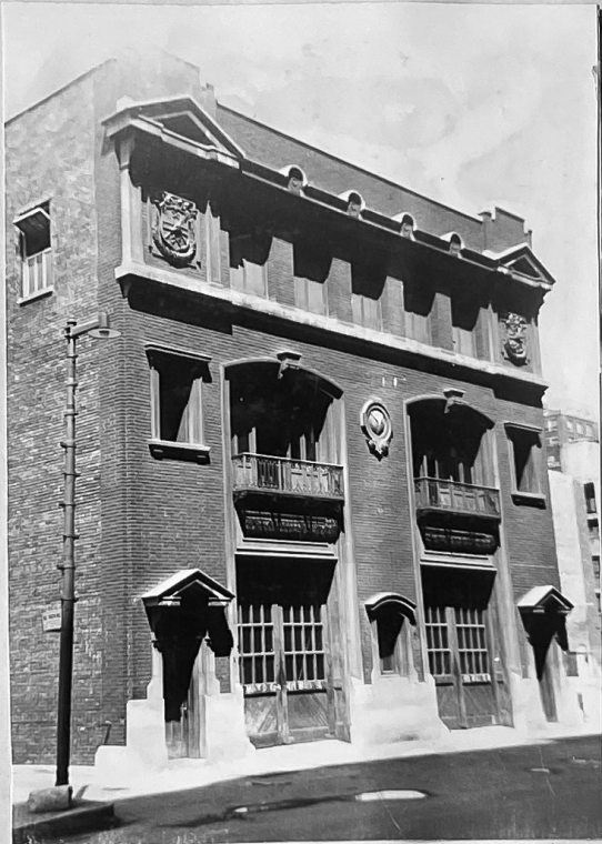
ENGINE 1 - TRUCK 1 214 LOMAX PLACE