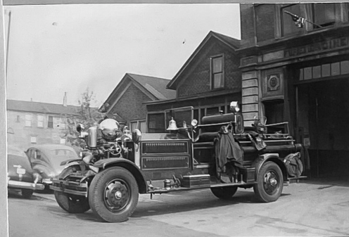
Old apparatus and quarters of Engine 31 at 2012 Congress Street leaves a record of advancement in new super-highway systems now coming popular in large cities. Moved from here to Engine 107 on Sept 23, 1952, discontinued from active service as an engine company from Eng 107 to form to crew of new Truck 56 on Feb 1, 1954. Engine 31's Congress Street location was also headquarters of the 2nd Division Marshall. His quarters are now at Engine 24 in Warren Blvd. (app by Robt March)