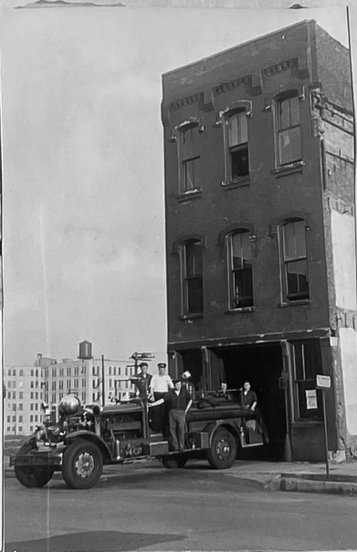
LEFT: OLD BUILDING of ENG-TRK-AMB No. 1 that stood at 214 Lomax Place until razed in 1950. TOP: AHRENS-FOX pumper that ran as Engine Company 3. RIGHT: Located on the southside at 855 West Erie St, this old structure housed ENG 3 from 1888 until it was discontinued from service and company faded away in history on May 16th 1956.