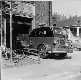
SQUAD - 13 330 W. 104 TH St (WASHINGTON HTS) 1949 AUTOCAR "ENGINE 93"