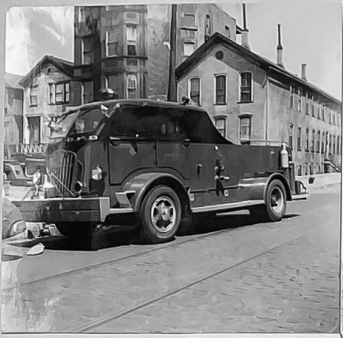
SQUAD - 1 119 N. Franklin St (LOOP) 1954 AUTOCAR "ENGINE 40"