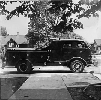
SQUAD - 11 4837 N. Lipps Ave (JEFFERSON PK) 1954 AUTOCAR "ENGINE 108"