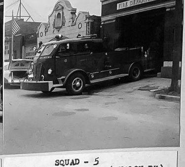
SQUAD - 5 7982 SO Chicago Ave (AVALON PK) 1954 AUTOCAR "ENGINE 72"