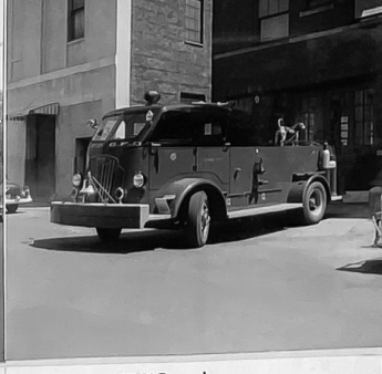
SQUAD - 4 1219 Gunnison Ave (UPTOWN) 1954 AUTOCAR "ENGINE 83"