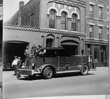
SQUAD - 10 522 Webster Ave (LINCOLN PARK) 1954 AUTOCAR "ENGINE 22"