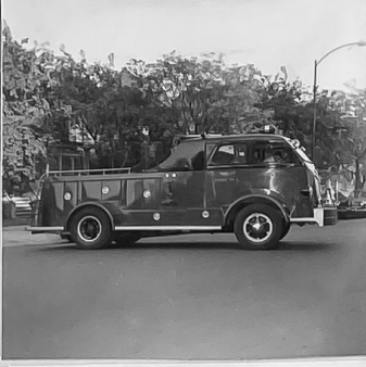
SQUAD - 3 5349 S. Wabash Ave (WASHINGTON PK) 1954 AUTOCAR "ENGINE 61"