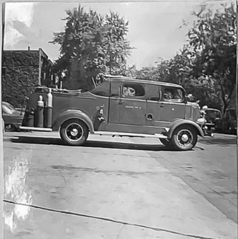
SQUAD - 6 2179 Stave St (LOGAN SQUARE) 1949 MACK "ENGINE 43"