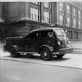
SQUAD - 7 2858 Fillmore St (DOUGLAS PARK) 1952 AUTOCAR "ENGINE 66"