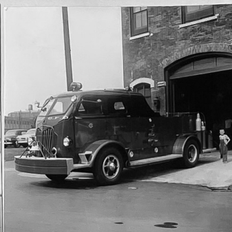
SQUAD - 8 2421 S. Lowe Avenue (BRIDGEPORT) 1954 AUTOCAR "ENGINE 2"