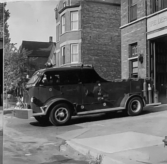
SQUAD - 9 5259 S. Wood St (CORNELL SQUARE) 1954 AUTOCAR "ENGINE 116"