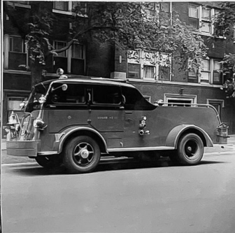
SQUAD - 12 8122 S. Ashland Ave (AUBURN PK) 1949 AUTOCAR "ENGINE 129"