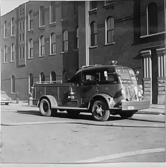
SQUAD - 2 114 N. Aberdeen St (UNION PARK) 1952 AUTOCAR "ENGINE 34"