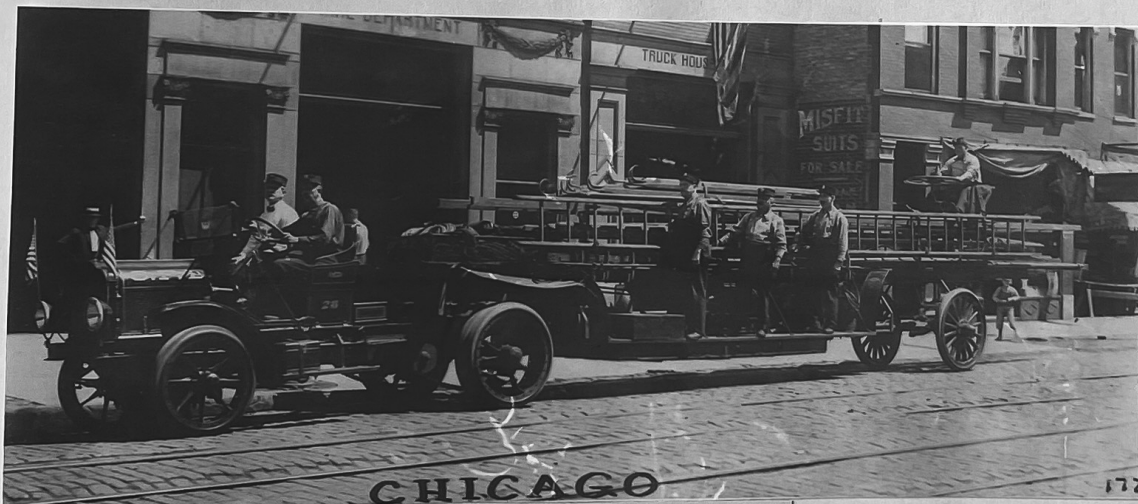
Trk-28 in front of gtr's @ - 1625 North Damen Ave. (1920s)