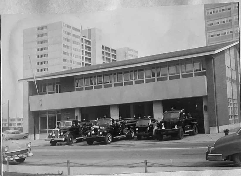
TOP LEFT - ENG 19 when located temporarily with ENG 48 from Dec 7, 1953 to April 16, 1956 when moved to their new building at 3421 Calumet Avenue in Lake Meadows area.